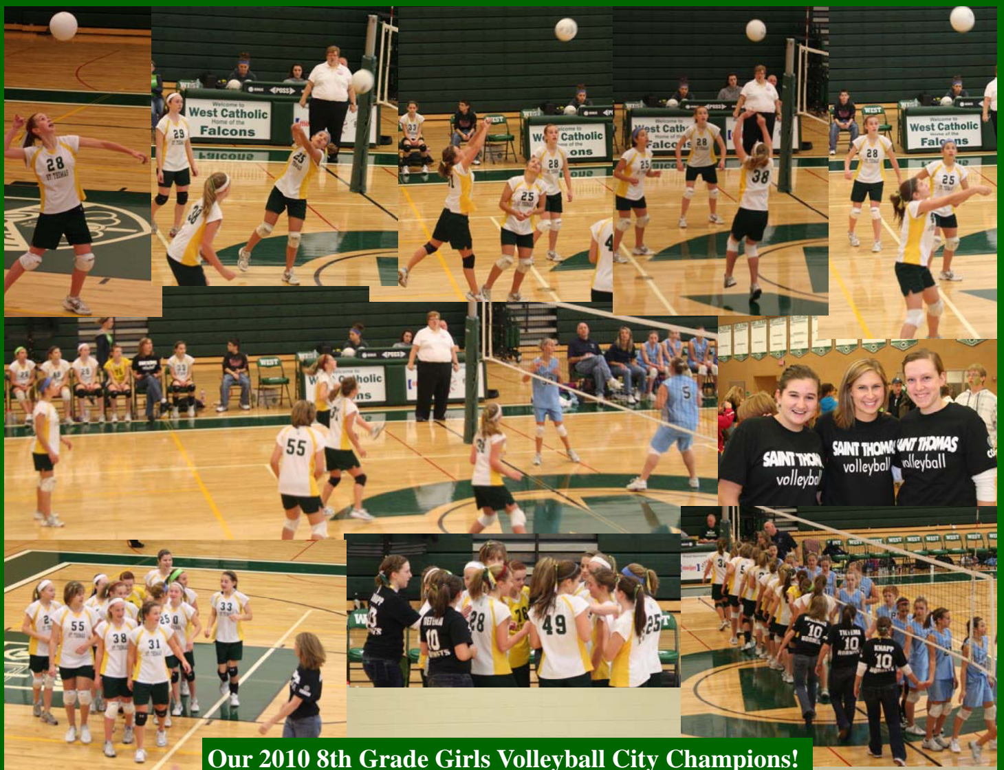
Our 2010 8th Grade Girls Volleyball City Champions!