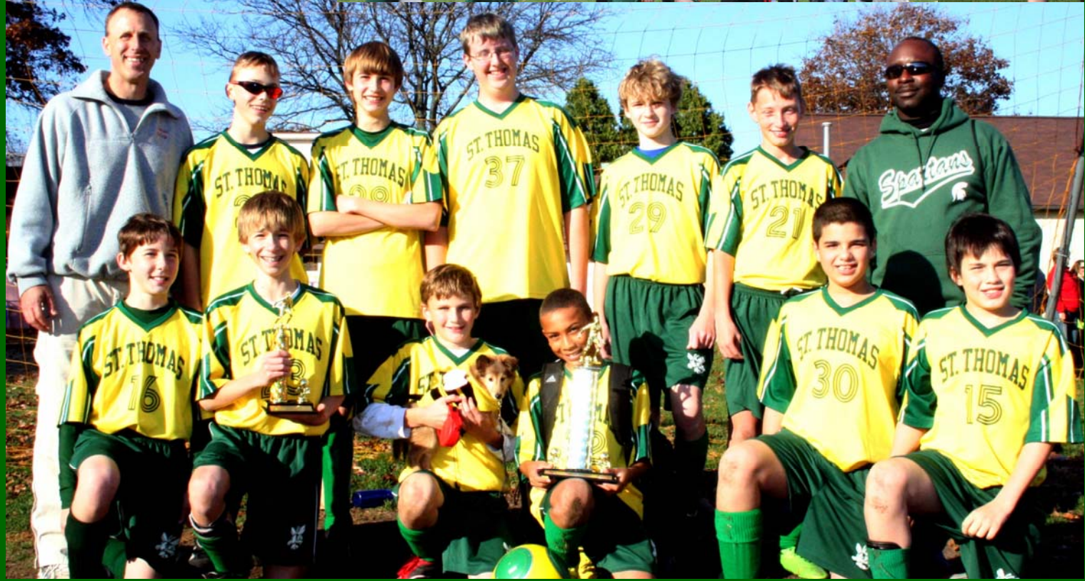
Saint Thomas Hornets—2010 City Soccer Champions