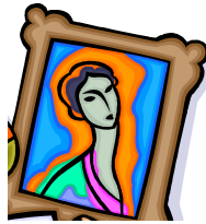
Picture removed for Internet Safety Purposes