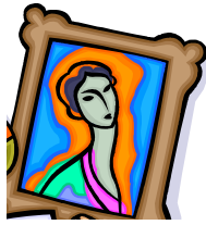
Picture removed for Internet Safety Purposes