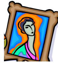
Picture removed for Internet Safety Purposes