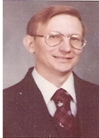
1978 (earliest picture available)

A Keeper and Defender of the Faith A True Historian A Master Teacher A Master Catechist A Family Man A Patriot A Civil War Reenactor A World War II Reenactor The First Ever Recipient of the Student Council Elizabeth Ann Seton Award A Collector A Director A Colleague A Friend One of the Good Guys